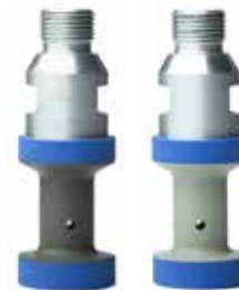
position 5 is also available in express polishers